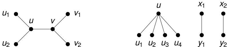
Figure: Forests T (left) and F_3 (right) are not EDP 3-colorable.

Proposition 8 [K.–K.–X., 2025+]: For every n \neq 3 path P_n is SEDP 3-colorable. For every k \geq 4 and any n , path P_n is SEDP k -colorable.